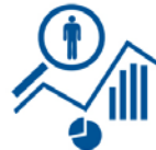
Risk Score Accuracy